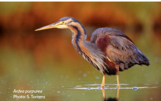
Ardea purpurea

The Nature Reserve covers a surface of 211 hectares, with additional peripheral protection of its surrounding 290 hectares, where certain land use and activities are regulated to prevent unwanted environmental impact.