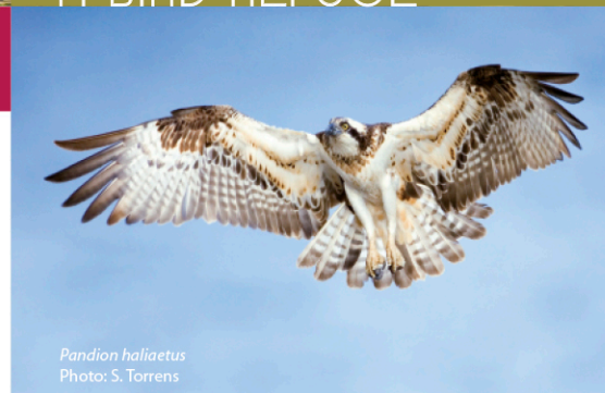
Pandion haliaetus

Like other Mediterranean wetlands, S'Albufereta is an essential sanctuary along the annual migratory paths of countless aquatic birds. Moreover, during the harsh summer droughts that typify the Mediterranean climate, wetlands like S'Albufereta become genuine oases for many bird species.